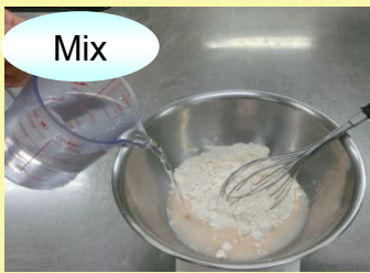
Whisk batter mix with cold water

【Ingredients】 Chicken: 1 ¼ lb Karaage batter mix: 1 cup Cold water: ½ cup