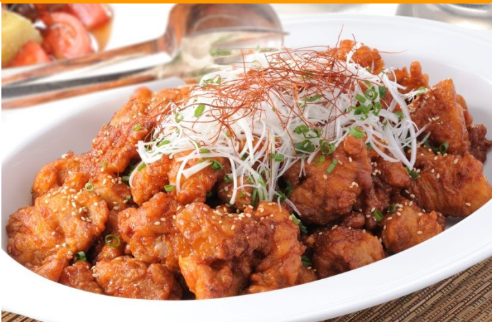
Red Hot Karaage chicken at a buffet