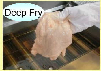
Deep fry at 350F for 4 minutes